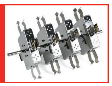
Stainless steel tube holders provide years of trouble free use